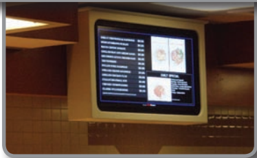
Top: A full screen promotional sign in a Nellis AFB cafeteria. Mid-top: A dual sign featuring promotional and menu content. Mid-bottom: A side by side menu board. Bottom: An overhead menu board.

More information about Nellis AFB at www.alivepromo.com/government/Nellis/